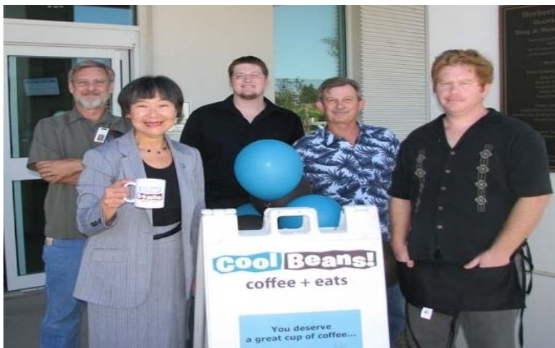
Courtesy of Turning Point / Assembly Member Mariko Yamada & Turning Point staff