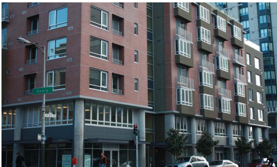
The Polk Senior Housing is located at 990 Polk Street, San Francisco.

The staff held a Thanksgiving dinner in November for tenants who already moved in to the Polk site. Staff plan to have all 110 units occupied by the end of the year. An official opening ceremony for the development is set for spring.